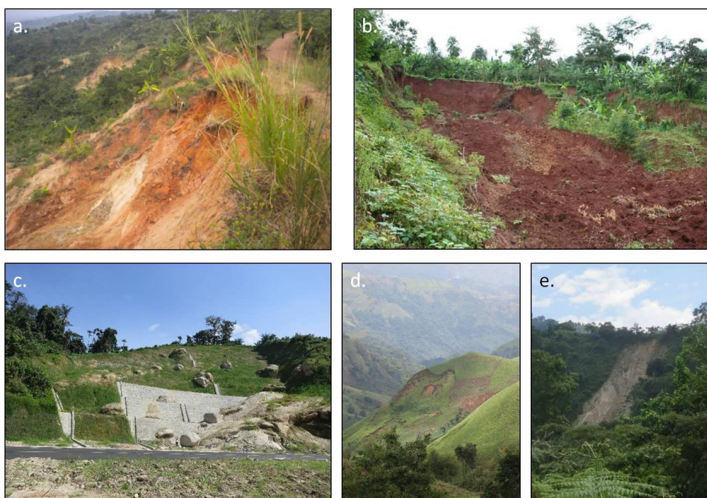
a) deep landslide scarp (and several in the background) in the lowlands of Katumba parish, Bundibugyo district, Rwenzori Mountains (Uganda); b) 8m deep translational landslide reactivated in September 2014; BushyI sub-county, Bududa District, Mt Elgon (Uganda); c) landslide of March 2014 stabilized with terraces and retaining walls along the Bamenda – Mamfe road, Cameroon; d) small shallow landslides within a larger landslide, Magha, Bamboutos caldera, West Region, Cameroon; e) debris slide into Nyamwamba river, Kilembe sub-county, Kasese district, Rwenzori Mountains (Uganda).